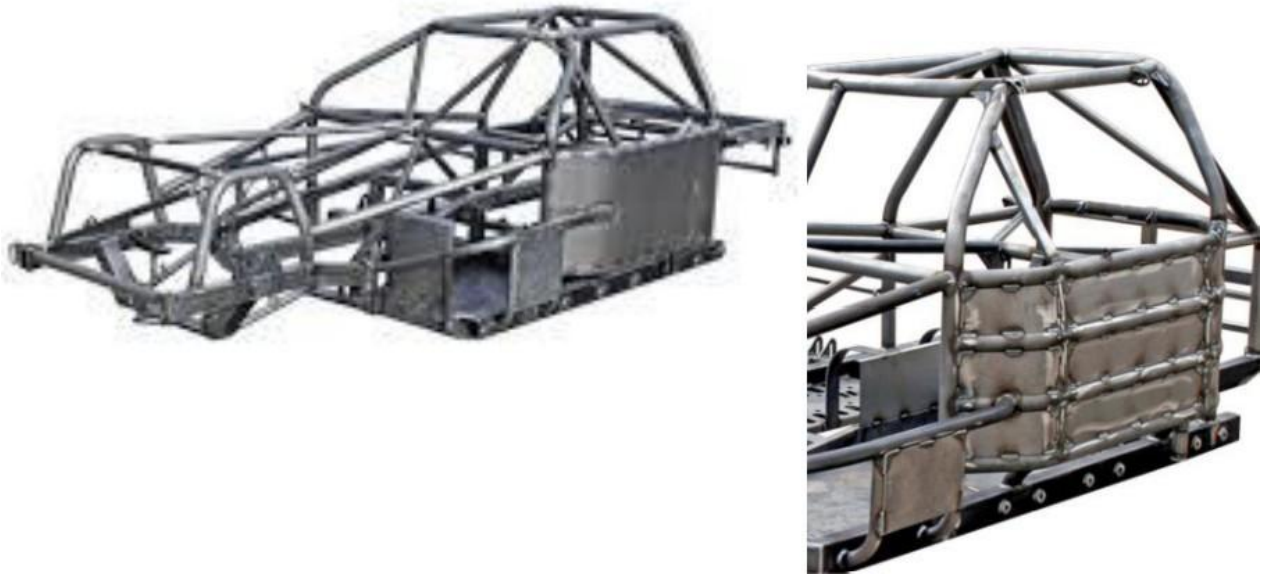
Illustration pictured below.