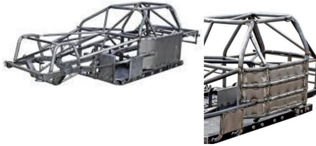
Illustration pictured below.