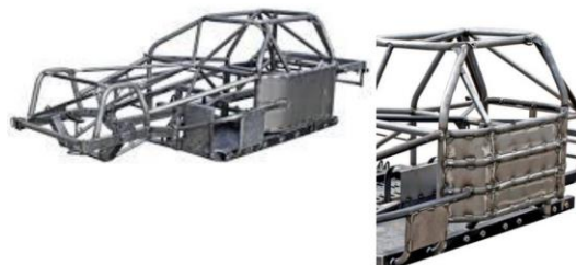
Illustration pictured below.

Plan B – minimum 0.125-inch (1/8") thickness steel plate must be welded to the space between each left-side door bar. Offset chassis right side door bars commonly called the outrigger or the kick-up bar, must be constructed of a minimum 1.250-inch x .065-inch wall round or square steel stock. Front of outrigger bar must go to right front frame behind right wheel. All supporting substructure must be constructed of 1-inch x .063-inch wall round or square steel stock. No material substitutions permitted.